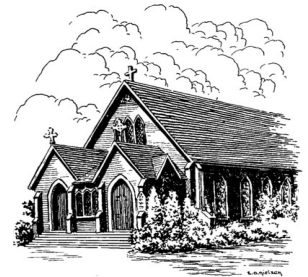
Calvary Episcopal Church

Calvary Episcopal Church 532 Center Street Santa Cruz, California 95060