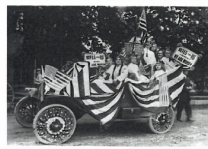
100 years after winning the right to vote, women and girls are still fighting for political equality.