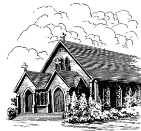
Calvary Episcopal Church

Calvary Episcopal Church 532 Center Street Santa Cruz, California 95060